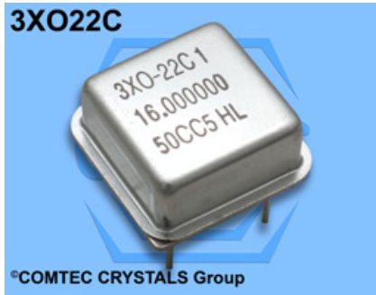
Crystal Clock Oscillator 3XO-22C5.0 DIL 8 5.0V