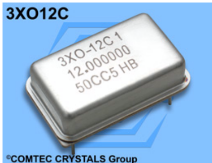
Crystal Clock Oscillator 3XO-12C5.0 DIL14 5.0V